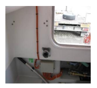
Inside view of water connection