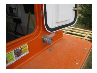
External water connection at right side below door